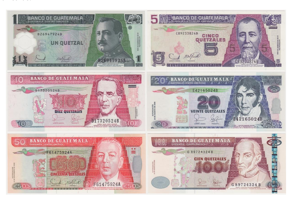
These are Guatemalan Ouetzales!

When traveling to Guatemala, it's advisable to exchange currency before departing. One can visit a local bank or AAA to exchange money for Guatemalan currency. The country's official currency is the Quetzal, with a conversion rate of approximately 1.00 USD to 7.50 GTQ. ATMs in Panajachel accept Visa and Mastercard for cash withdrawals. Travelers are advised to exchange a minimum of $250 or an amount depending on their expenses. In case of low Quetzales, a staff member can facilitate a visit to a bank for exchanging dollars, but this will require a passport and dollars without any stains or wrinkles. It's vital to carry cash, as most transactions require cash payments rather than credit or debit cards.