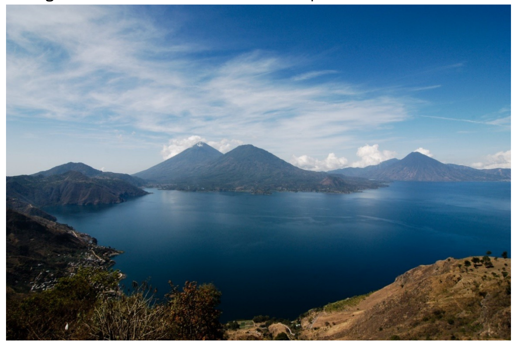
The glorious view of Lake Atitlan, get used to this!

Guatemala boasts of a diverse indigenous culture and is home to over 23 different languages. Although Spanish is the official language, most locals speak their native language or dialect. During the workdays, Worthy Village groups will be partnered with translators, so volunteers should not hesitate to request translation when necessary. The translators are there to help! When teaching the Worthy Village Healthcare Book, volunteers will work with a designated translator assigned to translate the information and presentation.