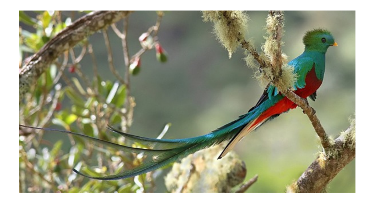
The quetzal bird is the national bird of Guatemala.

Outlets in Guatemala handle the same voltage as the U.S. Feel free to bring any chargers and electrical utilities that you think may seem appropriate.